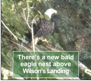
There's a new bald eagle nest above Wilson's Landing